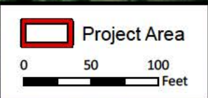
Figure No.: 9 Prepared By: MG Sketch Date: 2/6/2024 Map Scale : 1 inch = 100 feet

Chevis Road Tract Chatham County, Georgia