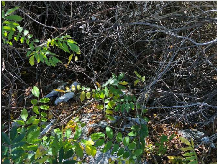
6 - View within wooded area on southern portion of site, facing southeast.