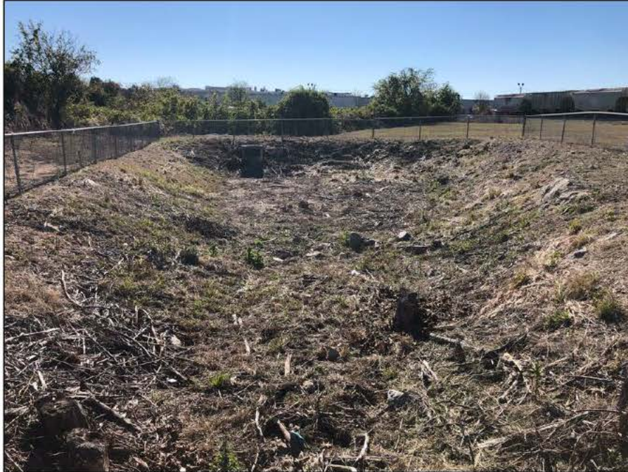
1 - View of stormwater detention basin on southeastern portion of site, facing south.