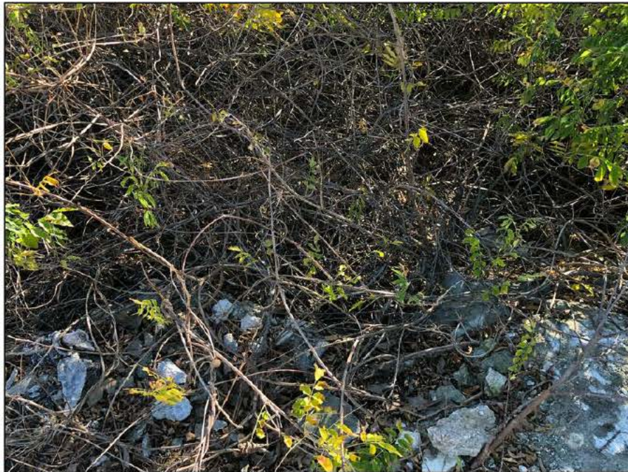
4 - View of wooded area on southern portion of site, facing south.