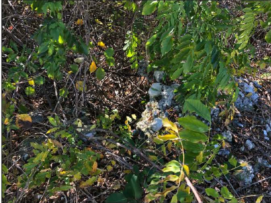
5 - View of wooded area on southern portion of site, facing south.