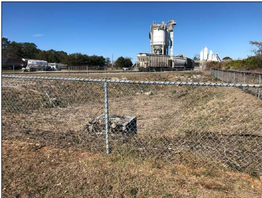
2 - View of stormwater basin on southern portion of site, facing north.