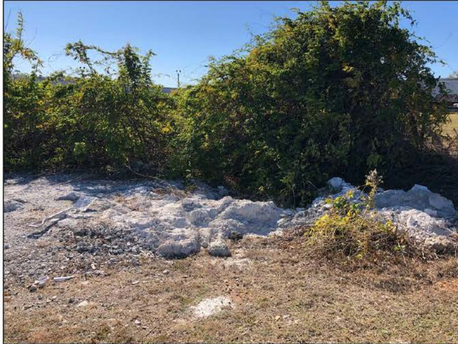
3 - View of concrete pile on southern portion of site, facing south