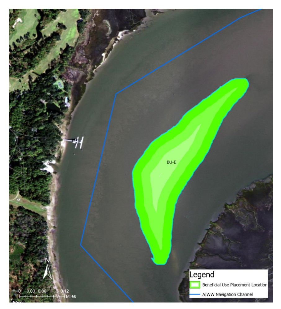
Figure 2. BU-E Placement Site