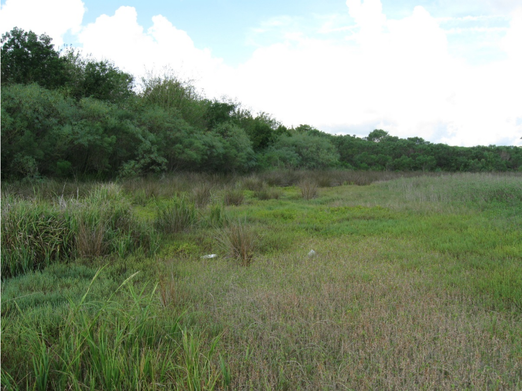
Figures 5 and 6. Area C Vegetation Coverage.