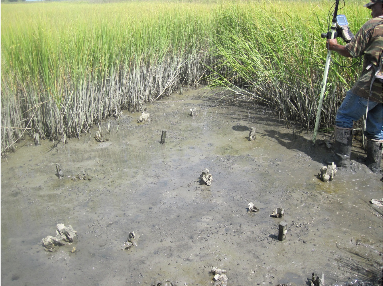
Figure 3 (above). Survey Efforts in Area 12.