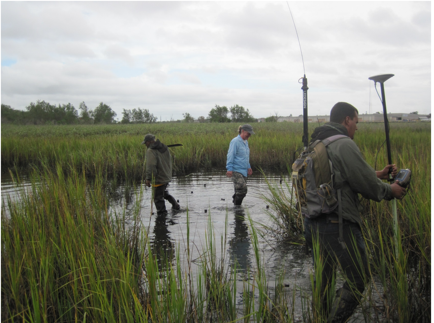
Figure 2. Survey Efforts in Area 10.