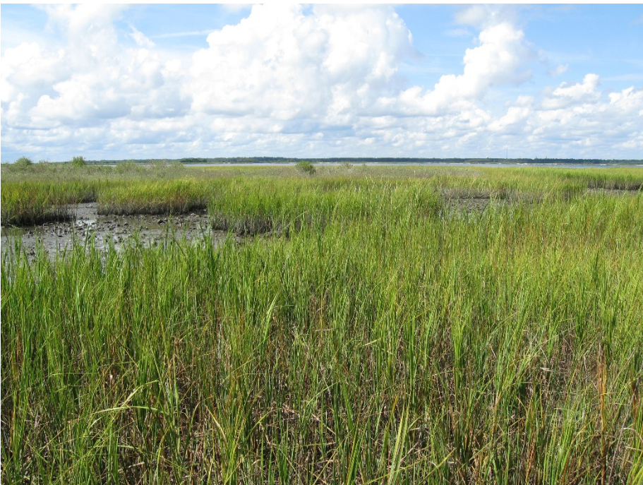
Figure 4 (Left) Area J.