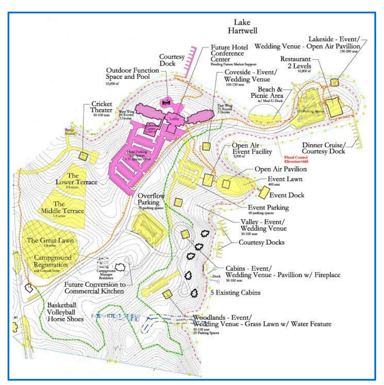
Exhibit 3: Day Use Area.