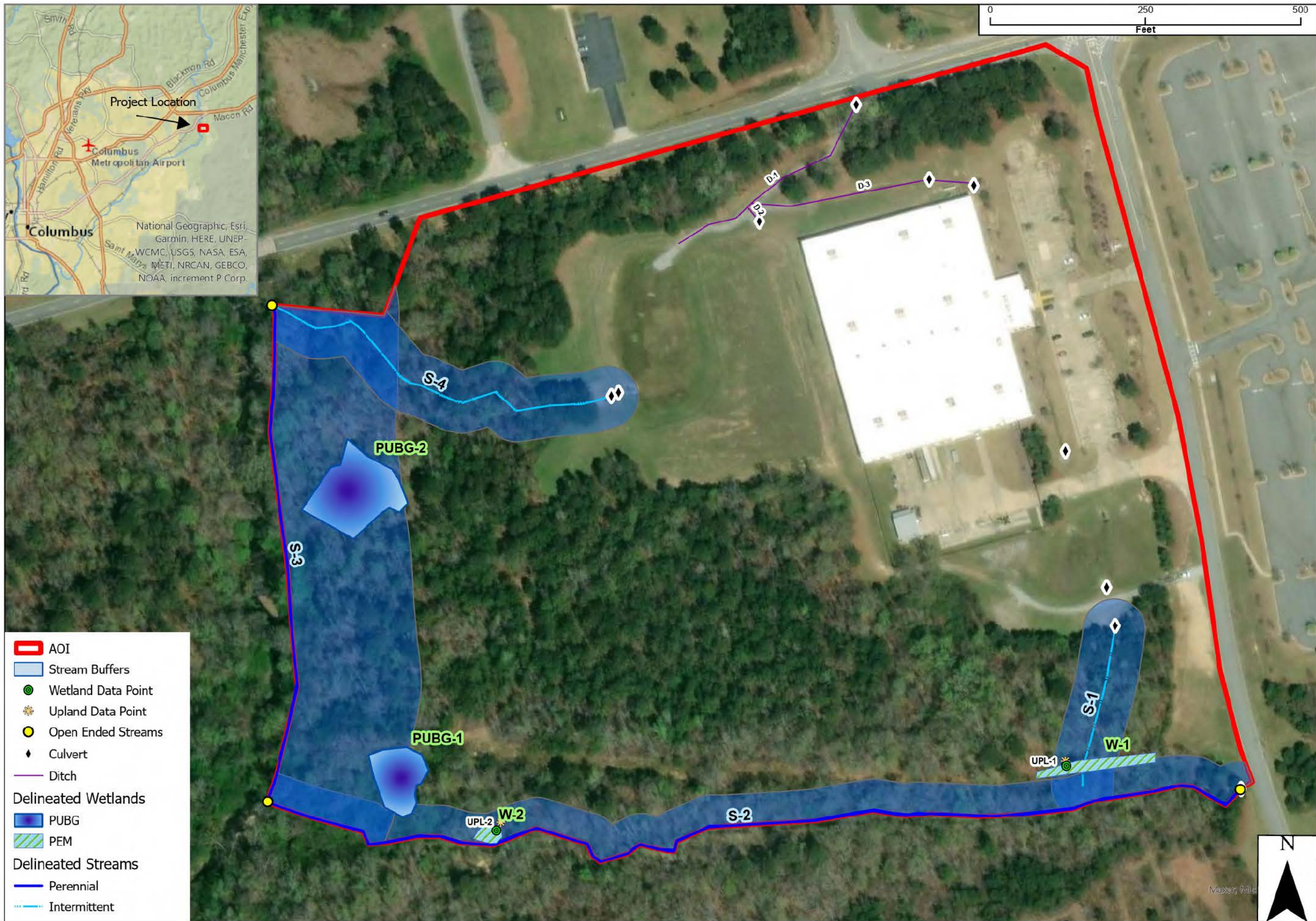
Project North Star - Columbus, GA Figure 3 - Delineated Aquatic Features Map Muscoogie County, GA