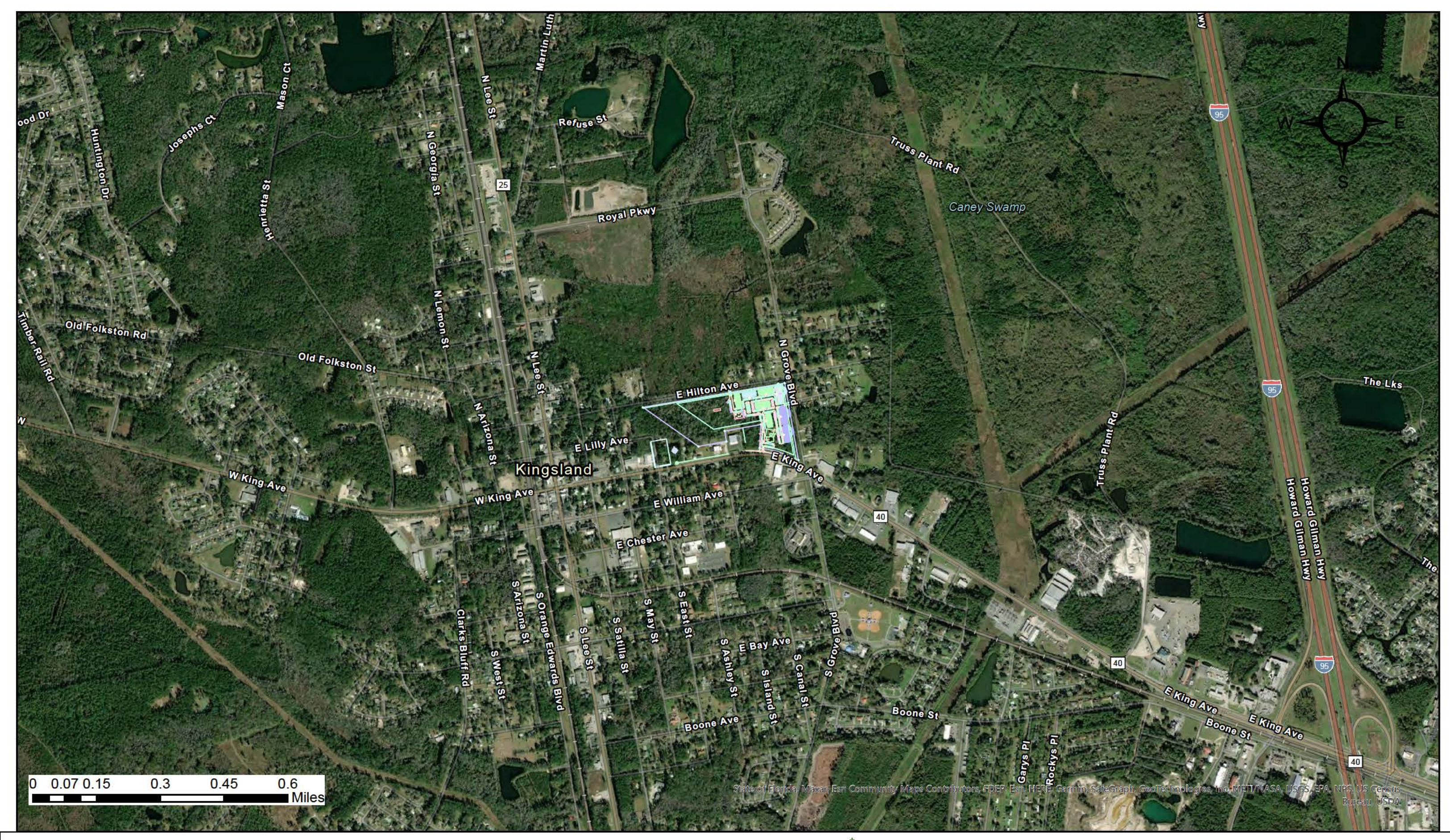
FIGURE 2 : SITE LOCATION SOURCE: PROJECT NUMBER: 22-14 PROJECT NAME: GROSS WETLANDS

Some notes: Property boundaries are estimated, please consult a surveyor.