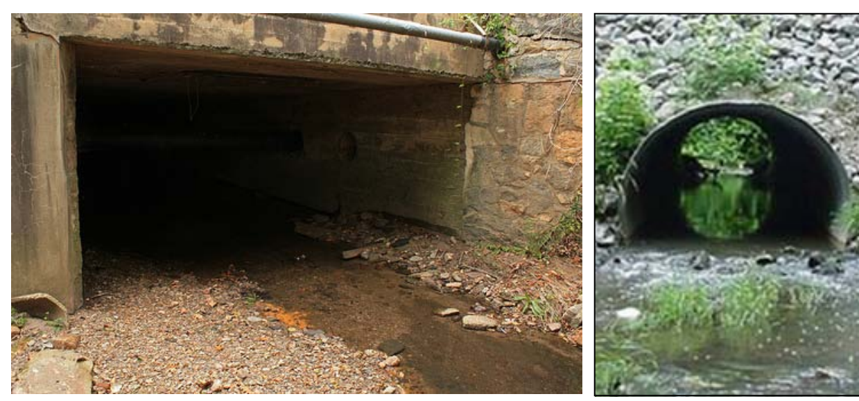
These bottomless or embedded culverts were sized so they are wide enough to carry baseflows without altering stream depth (i.e., width equal to or slightly greater than the average channel width).