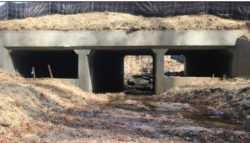
Culverts, set at bankfull elevation (top) or with baffles constructed at bankfull height carry flood waters but do not overwiden the channel at baseflow.